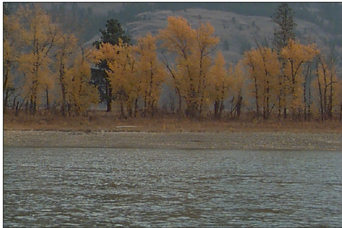
LEFT BANK VIEW