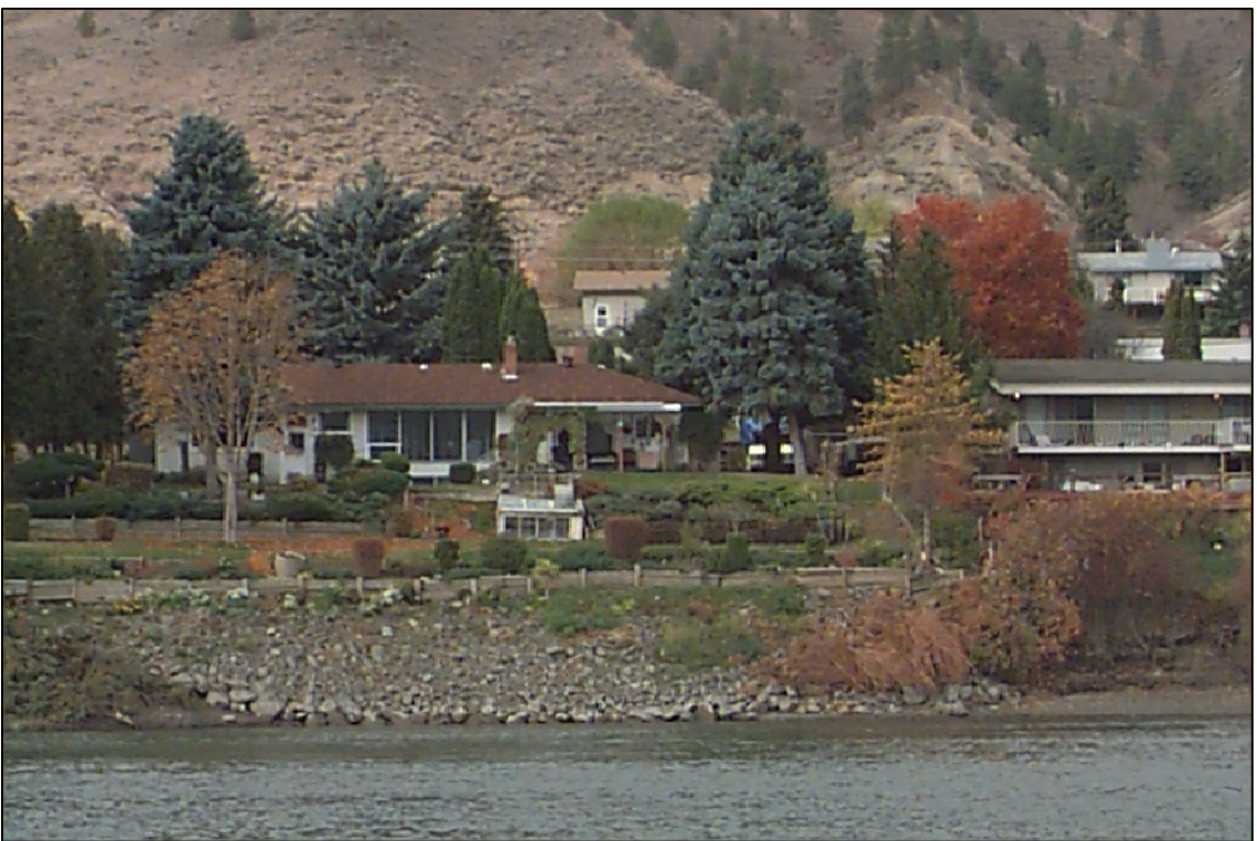
RIGHT BANK VIEW

(NOTE: First point is a DUMMY station offset at 2000 metres from 0 chainage.)